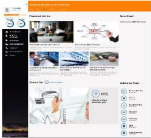
News & Insights